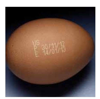
Laser marking on egg

Laser coded eggs have the highest level of code permanence because the laser etches the surface of the egg. But CIJ can create a very durable image on an egg printed with a permanent food grade ink. Videojet inks will more than withstand the handling from production to consumer and will adhere through cooking in boiling water.